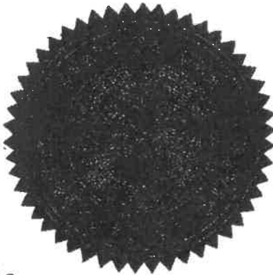
PAUL D. PATE SECRETARY OF STATE

The amount of $20.00 was received in full payment of the filing fee.