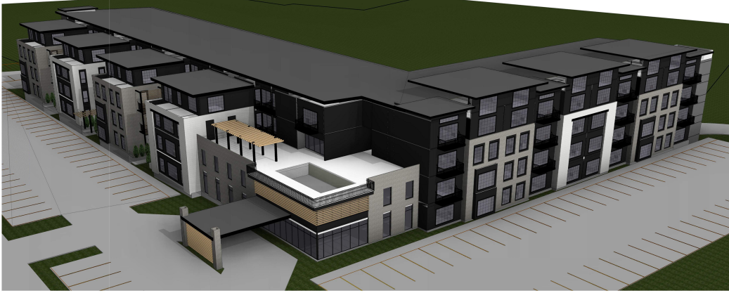
3 AERIAL VIEW SCALE