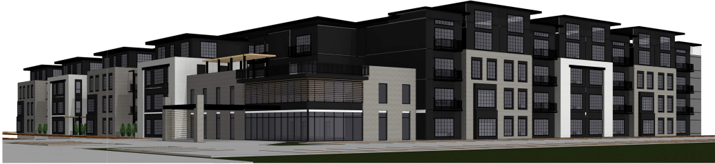
1 VIEW FROM SW SCALE