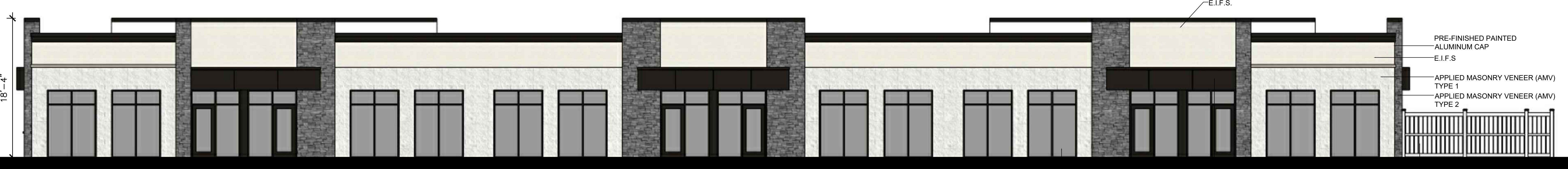
NORTH ELEVATION NO SCALE

NOTE: THESE ELEVATIONS HAVE BEEN DESIGNED TO MEET THE REQUIREMENTS OF THE CITY OF WAUKEE'S ARCHITECTURAL DESIGN STANDARDS AND THE APPROVAL OF THE PLANNING COMMISSION / CITY OF WAUKEE. CHANGES SHALL NOT BE MADE TO THE APPROVED ELEVATIONS UNLESS APPROVED BY THE LOCAL JURISDICTION.