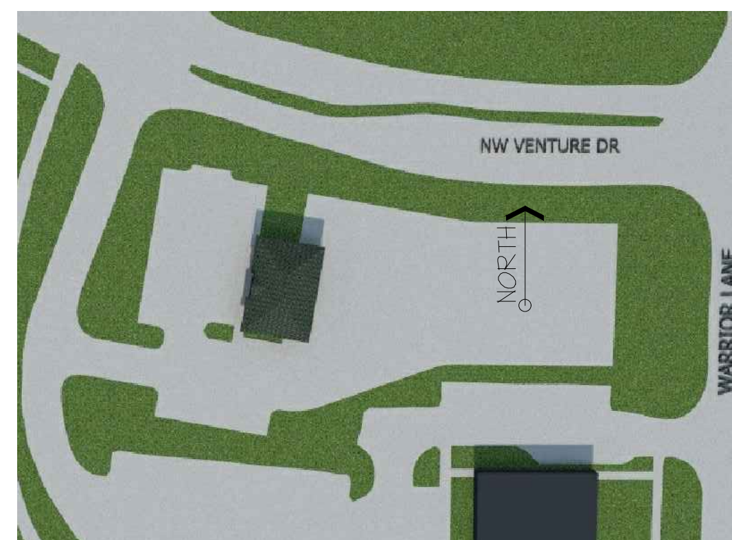
Schematic Site Plan