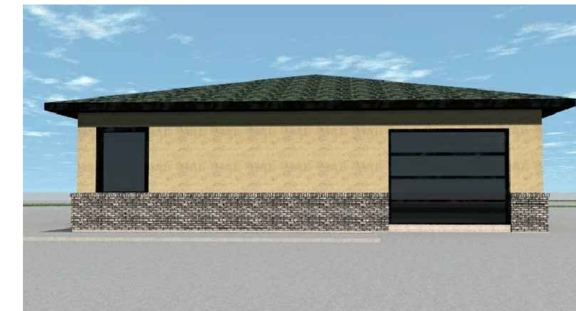
Right Elevation NORTH