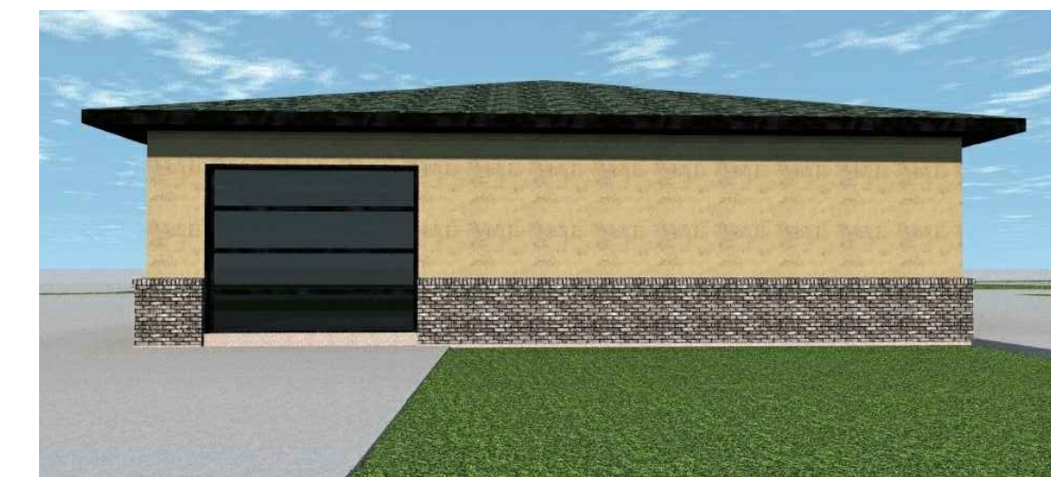
Left Elevation SOUTH