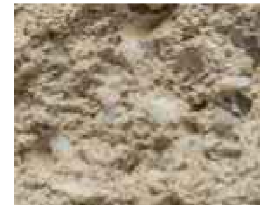
ECHELON STANDARD MASONRY SPLIT FACE CMU - SEASHELL