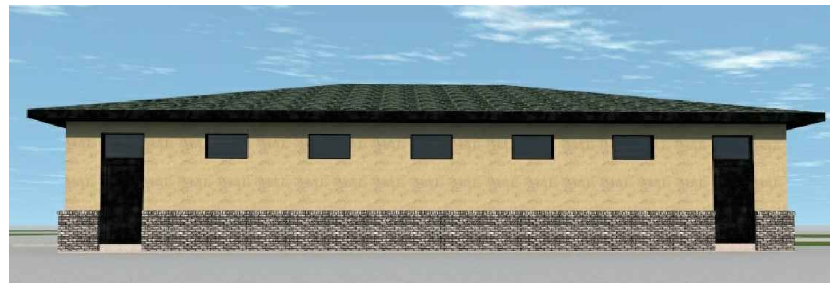
Rear Elevation WEST