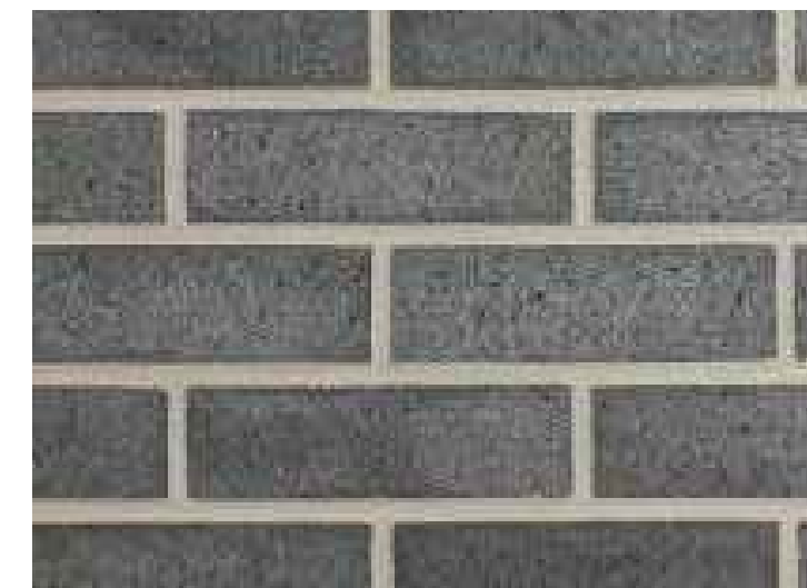
GLEN-GERRY BRICK EBONITE VELOUR BRICK