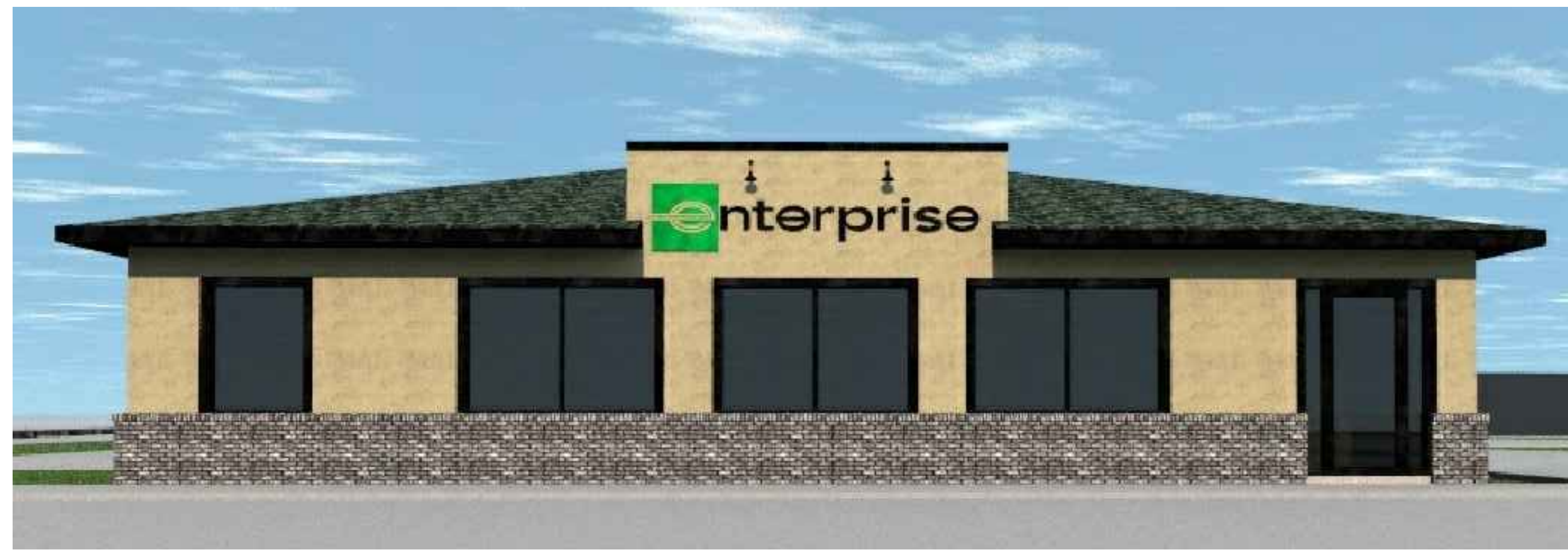
Front Elevation EAST