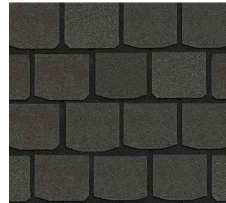
CERTAINTED - HIGHLAND SLATE - BLACK GRANITE