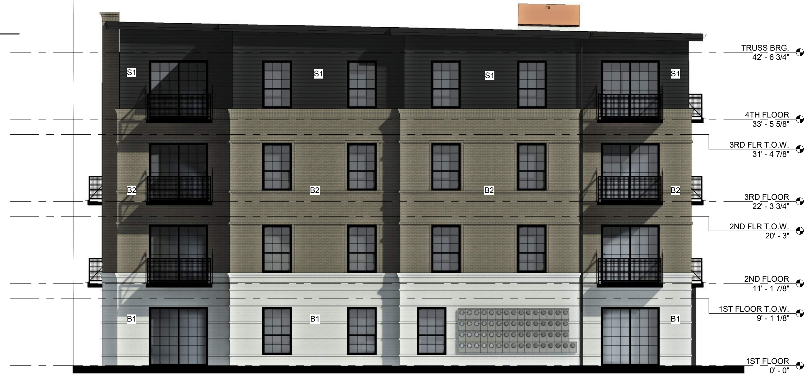
3 SOUTH ELEVATION SCALE: 1/8" = 1'-0"