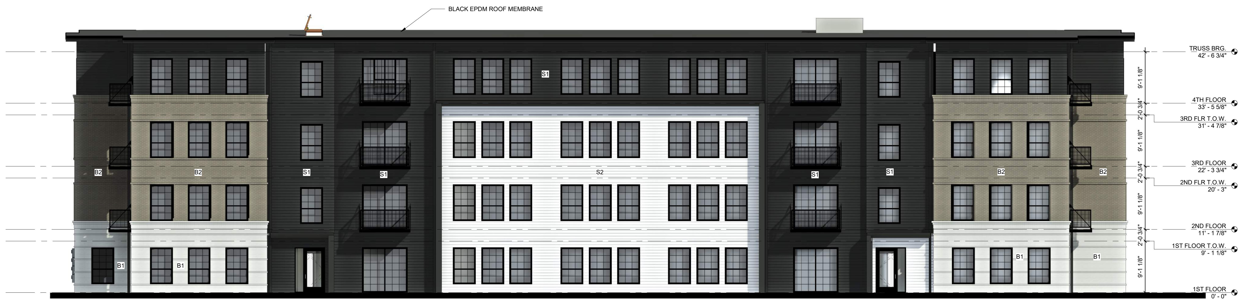
1 EAST ELEVATION SCALE: 1/8" = 1'-0"

3611 NE Otterview Circle #43 Ankeny, IA 50021 Phone: (515) 597-5457 www.jcorpdesignbuild.com