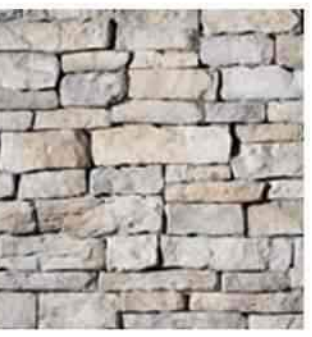
Centurion Stone - Color Tulsa