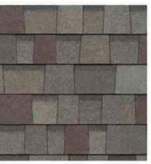
Tamko Heritage Weathered Wood Shingles