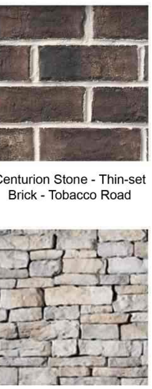
Centurion Stone - Thin-set Brick - Tobacco Road