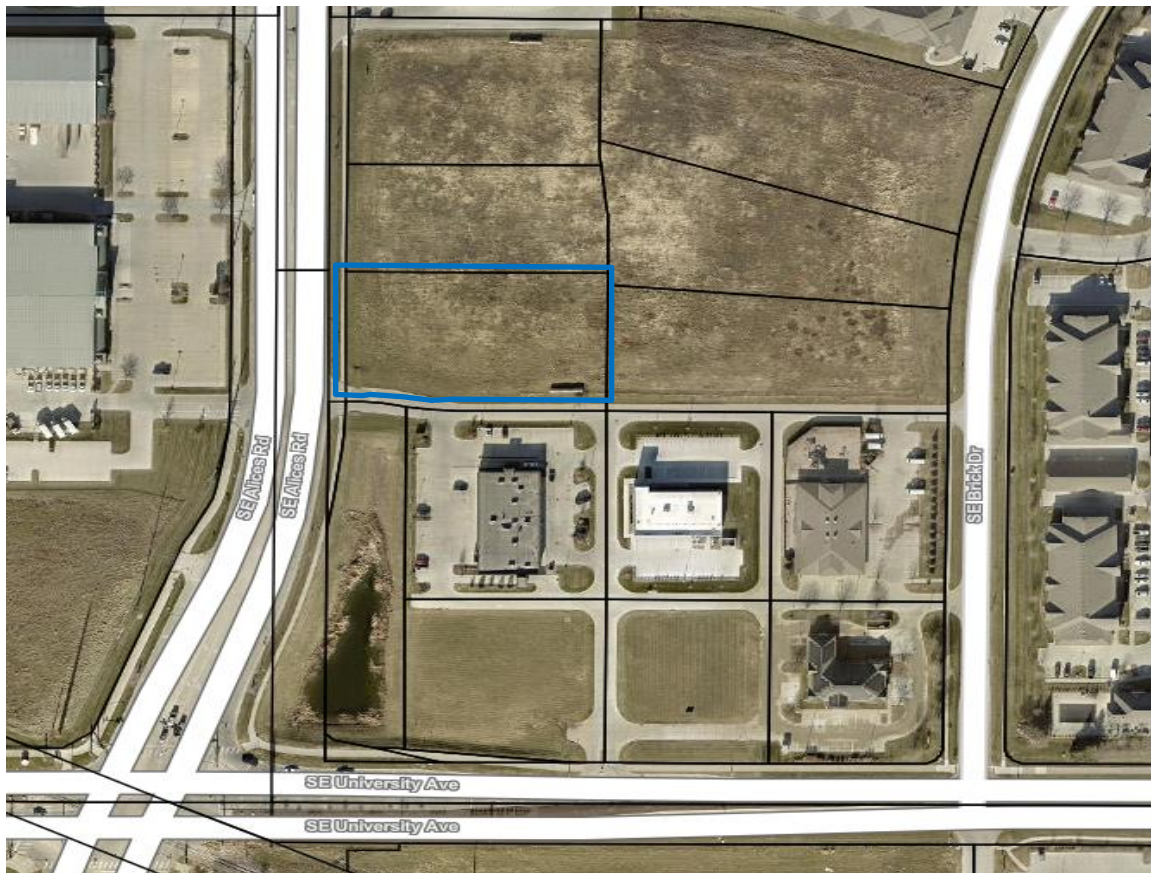
ABOVE: Aerial of subject property (outlined in BLUE ) in relation to the surrounding area.