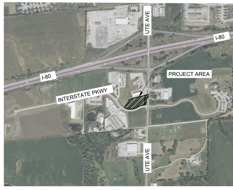
VICINITY MAP 1" = 1000'

OWNER: JKR PROPERTIES LLC DALLAS COUNTY ZONING: C-2 HIGHWAY SERVICE AND AGRICULTURAL RELATED COMMERCIAL